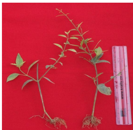
Fig. 2. Rooting of Andrographis elongata with IBA treatment.

Results indicated a vast spectrum of efficacy of growth hormones on percent sprouted, percent of rooting, root number and root length of stem cuttings of A. elongata (Table 1). The effect of IAA and IBA on rooting of stem cuttings in A. elongata growth hormones of various concentrations of IAA 500, 1000, 1500, 2000 and 2500 and IBA 500, 1000, 1500, 2000 and 2500 ppm were used. Interpretation of A. elongata as medicinal plant, especially as a property for andrographolide and flavones is known to plant investigations for a extended time. As propagation through seeds is rather complicated, cuttings have been showed for the application. The growth hormones IAA and IBA had deep root inducing capacity. The results on respond of plant growth hormones for rooting and root length were recorded 60 days after planting (Table 1).