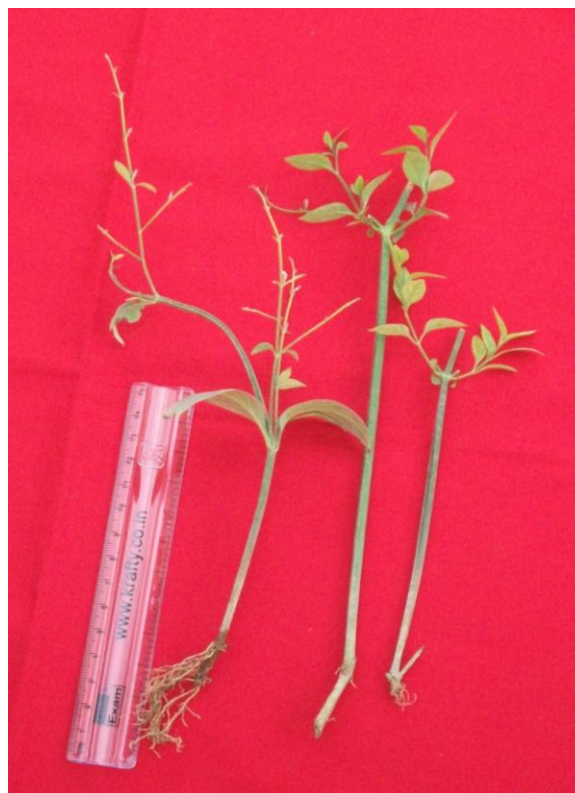
Fig. 3. Rooting of Andrographis elongata with IAA treatment.

The cuttings of A. elongata treated for IBA 1500 ppm were proved significantly effective for percent rooting while comparing with various growth hormones concentrations. Maximum number of leaves per cuttings was found for IBA 1500 ppm in A. elongata (Table 1). All the treatment of IBA and IAA indicatively the percentage of rooting in comparison to the control (Table 1). Among the IBA treatments maximum rooting percentage was noted with 1500 ppm (64.08) which was followed by 2000 ppm (48.13) 2500 (43.82), 1000 ppm (39.51) and 500 ppm (32.62) (Fig 2). The IAA treatments highest rooting percentage was recorded with 2000 ppm (60.24), which was followed by 1500 ppm (45.19), 2500 ppm (40.12), 1000 ppm (36.11) and 500 ppm (29.45) (Fig. 3). These treatments showed excellent effects than the control.