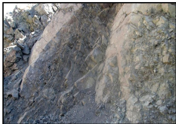
Fig. 5. F 4 fault's plate.

This fault is located at the east wall of southern anomaly XI extending NE-SW in the boundary of metasomatisme rocks and high ore rocks. Picture shows fault mirror of F 4 (Fig. 5).