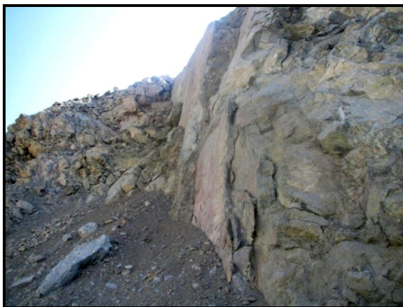
Fig. 7. F 6 fault's plate.

This fault is located in southern wall of mine extending NE-SW and its slope degree is about 80° to NW. Under the effect of this fault's function amphibolite rhyolite rocks are located beside ore with specified boundary. The signs of iron oxide are observable on the surface of this fault (Fig. 7).