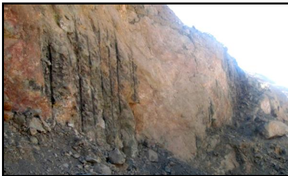
Fig. 2. Fault mirror of F 1 in workbench of Se-Chahun mine, southern anomaly XI, the view is toward SW.

This fault is located at the east wall of southern anomaly XI extending NE-SW in the boundary of sedimentary rocks and metasomatism. Fig. (2) shows fault mirror in Work bench of Se-Chahun mine.