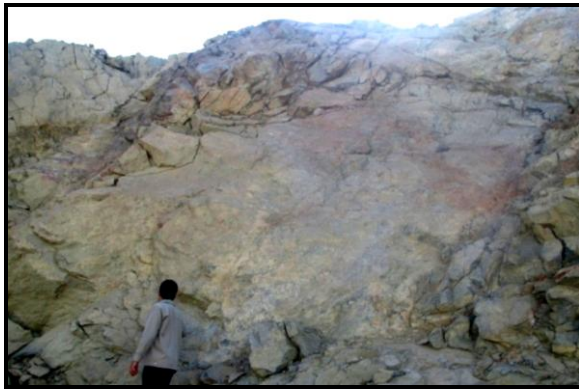
Fig. 6. F 5 fault in western wall of anomaly X, the view is toward west.

This fault is located at the western wall of the mine with 35° slope to NE (Fig. 25-2). Metasomatism rocks are beside rhyolite rocks (Fig. 6).