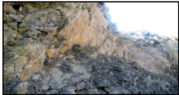
Fig. 4. F 3 fault plate in eastern wall of the mine.

This fault is located in eastern wall of mine on its stairs with 1590 m height extending NW-SE and its slope degree is about 90° to SW, it has led to creation of a boundary between metasomatisme rocks and low-grade ore (Fig. 4).