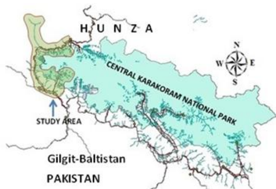
Fig. 1. Map of study area within Central Karakoram National Park (constructed using ArcMap 10.1).

Study was carried out in the North-Western part of CKNP which is the largest Protected Area in Pakistan (Fig. 1). It stretches over an area of 10,000 km 2 along the Karakoram mountain ranges and extends from 35°N to 36.5°N Latitude and from 74°E to 77°E Longitude. Park holds world's greatest glacial mass outside poles and harbors complex floro-faunal diversity. Anthro-po-climatic changes have lead species to greater vulnerability even critical endangered including Berberis ssp. (Hussain et al. , 2012; Alam and Ali, 2010; WWF Pakistan, 2009). Study area represents 21% (20.99%) of the total population.