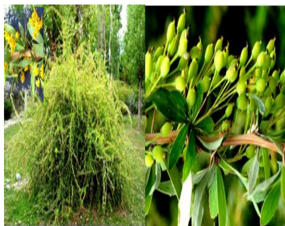
Fig. 1. A representative shrub of Berberis (left), inflorescence inset and its unripen berries (right) from Karakoram ranges (CKNP).

Mean plant height was observed was 2.71 m (SE ± 0.18) and range was from 1.75-3.37.