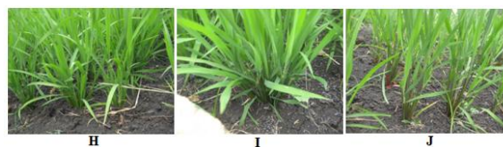
Fig. 1. Anthocyanin in F 1 and parent plants. Fig A-C represent cross between V1PGMS, V2TGMS and V3PGMS and Basmati370 while Fig. D-F represent cross between V1PGMS, V3PGMS and V2TGMS and Basmati217. Fig G represents Basmati370 and 217 while H-J represents V1PGMS, V2TGMS and V3PGMS in that order.