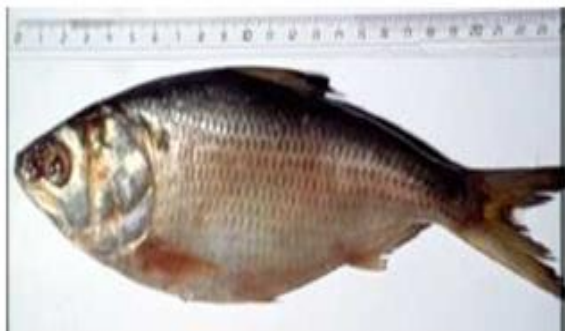
Fig. 1. Bonga fish ( Ethmalosa fimbriata ).

could be explained by the fact that the gills of fish are important organs in the phenomena of respiratory gas exchange are also richly vascularized and therefore constituted a center of concentration of microorganisms (Degnon et al. , 2013). It would be better to use the headless fish in feed formulation for children as done in this work.