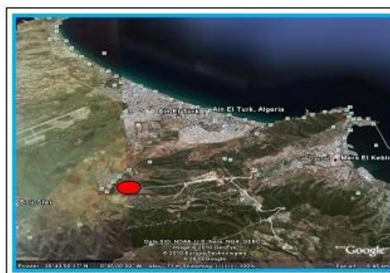
Fig.1. Site of taking of samples.

During the stage of delignification, we notice a bleaching of the substratum caused by the extraction or the degradation of lignins. This discoloration looked for among others in the industry paper-maker is explained by the presence of acids hexénuriques which contribute partially to the color of this substratum (Shatalov and Pereira, 2009). This proves the good choice of protocol of delignification used in the experimental part.